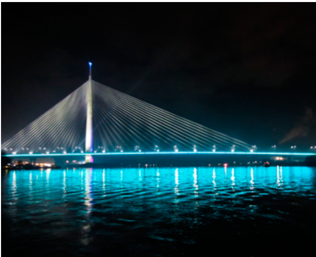
Featured products: ChromaStrip 25