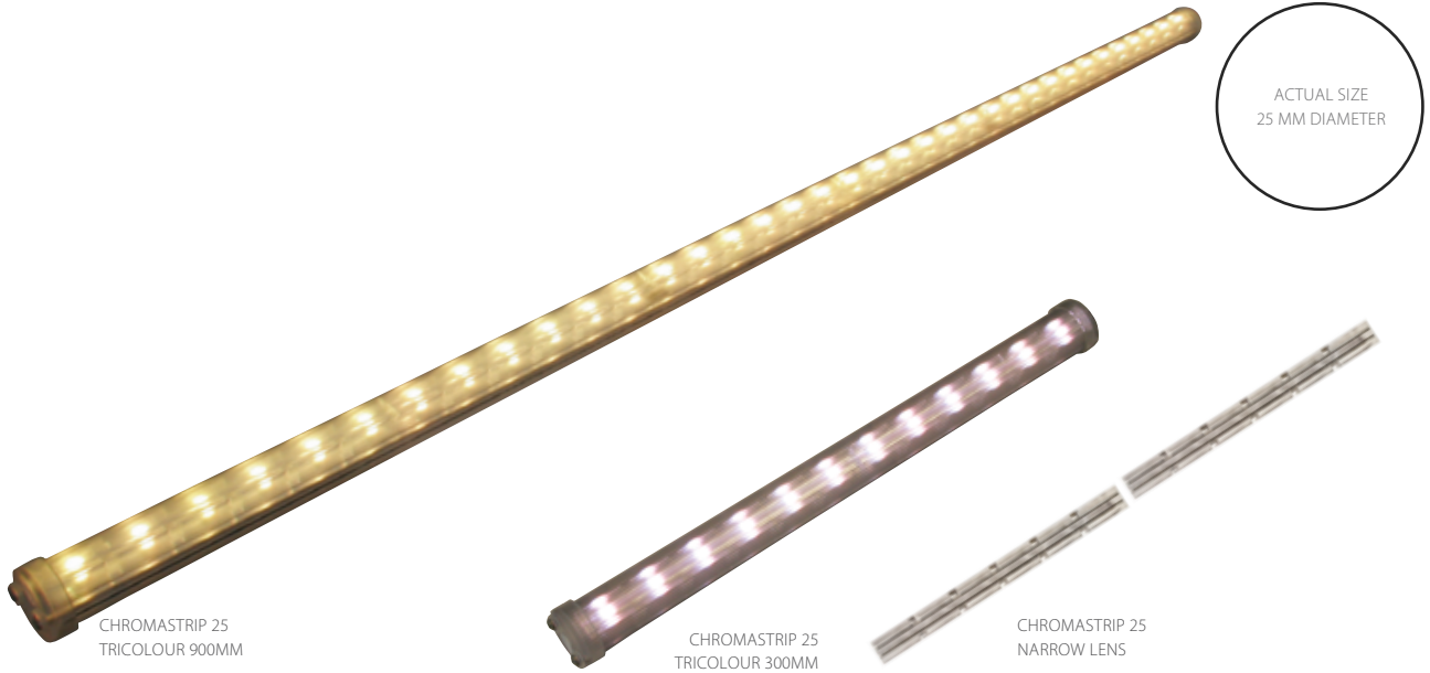
CHROMASTRIP 25 TRICOLOUR 900MM